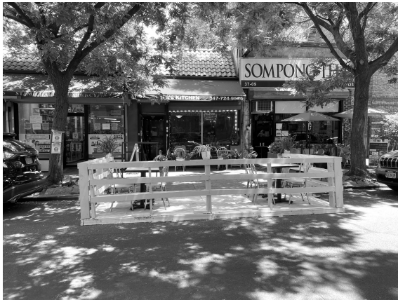
Figure 1. Within days of the launch of the Open Restaurants program, simple outdoor seating areas like the one above began appearing on city streets.