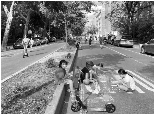
Figure 3. The 34th Avenue Open Street in Jackson Heights, Queens has become a well-used multi-use open space for local residents.

DOT committed to making long-term changes to 34th Avenue through a community-based design process. The first of these events, an online “Information and Listening Session” hosted by the DOT on December 2nd had more than 550 virtual attendees expressing strong and varied opinions about the concept of redesigning 34th Avenue as a permanently automobile-limited thoroughfare. Simultaneously, other neighborhoods were making similar demands and on January 28, 2021 Mayor de Blasio announced in his final State of the City speech that the Open Streets program, along with a number of other pandemic streetscape programs, would be made permanent although no specific details were provided (City of New York 2021). An Open Culture program, created by the City Council, also went into effect in January 2021, providing a legal mechanism for local arts and non-profit groups to use Open Streets for artistic and cultural events (New York City Council 2020).