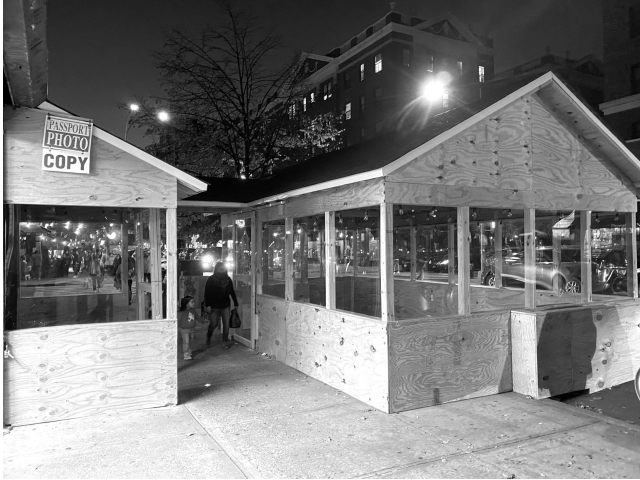
Figure 5. Confusing regulations and uneven enforcement have occasionally resulted in Open Restaurants designs that cause public safety and public access concerns.