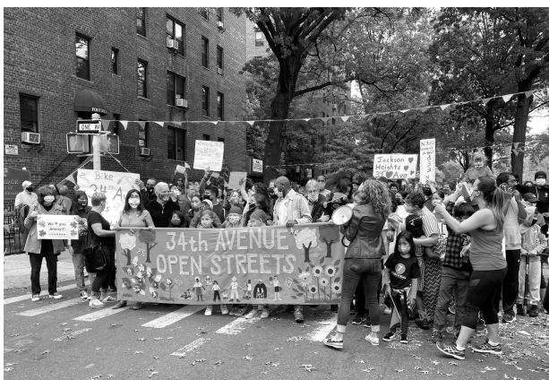
Figure 4. Jackson Heights residents organized a rally on October 24, 2020 to advocate for making 34th Avenue a permanent Open Street.